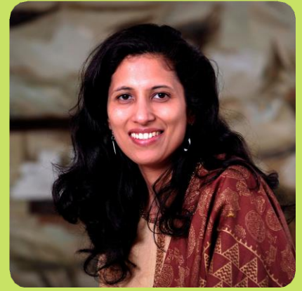
Leena Nair French Luxury Brand CHANEL CEO